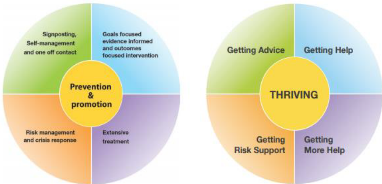
THRIVE framework, THRIVE Elaborated (2016)

4.2 The 4-tier service model has been complemented by i-THRIVE, which is a national programme of innovation and improvement in child and adolescent mental health. To help children and young people in Devon experience good emotional health and wellbeing support, the i-THRIVE framework tries to balance emotional health and wellbeing needs with the type of support that a young person may need.